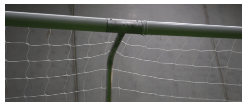
Connect to Cross bar